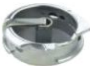
810 FOR: HOOK 810,820