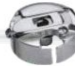
845TR FOR: BROTHER LT2-B845