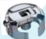
1.6 1.6 times the capacity