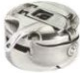
210D FOR: JUKI LK1910,1920,1930,AMS-210D