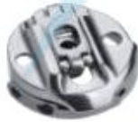
BC-PF3114 FOR: PFAFF 144, 155, 116, 3114, 3116