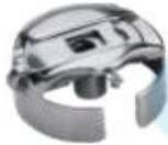
BC-DBM(Z2)-NBL3 BC-DBM(Z2)-NBL3 WITH NBL FOR: TAJIMA