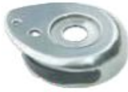
CP-M697 FOR: DURKOPP 697