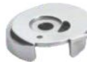
526 FOR: LU-1565, LUH-521, LUH-526