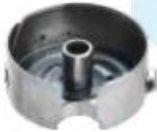
LBH-771 WITH NBL FOR: JUKI LBH-771,-772, -773,-781-4