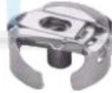
BC-9076(TG)-NBL6 PFAFF/DUPKOPP TYPE WITH NBL-806 SPRING FOR:PFAFF