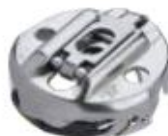
76 1 FOR: JUKI LBH761-763