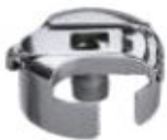
76 1 FOR: JUKI LBH761-763