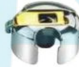
BC-DB1(G) GOLD HANDER